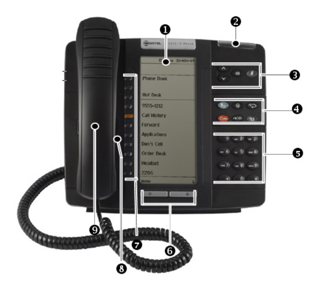
The 5320 IP Phone

The 5320 IP Phone supports Mitel Call Control (MiNet) protocol and session initiated protocols (SIP). It also supports Hot Desking and Clustered Hot Desking as well as Resiliency. The 5320 phone is ideal for executives and managers, and can be used as an ACD Agent or Supervisor Phone, as well as a Teleworker Phone.